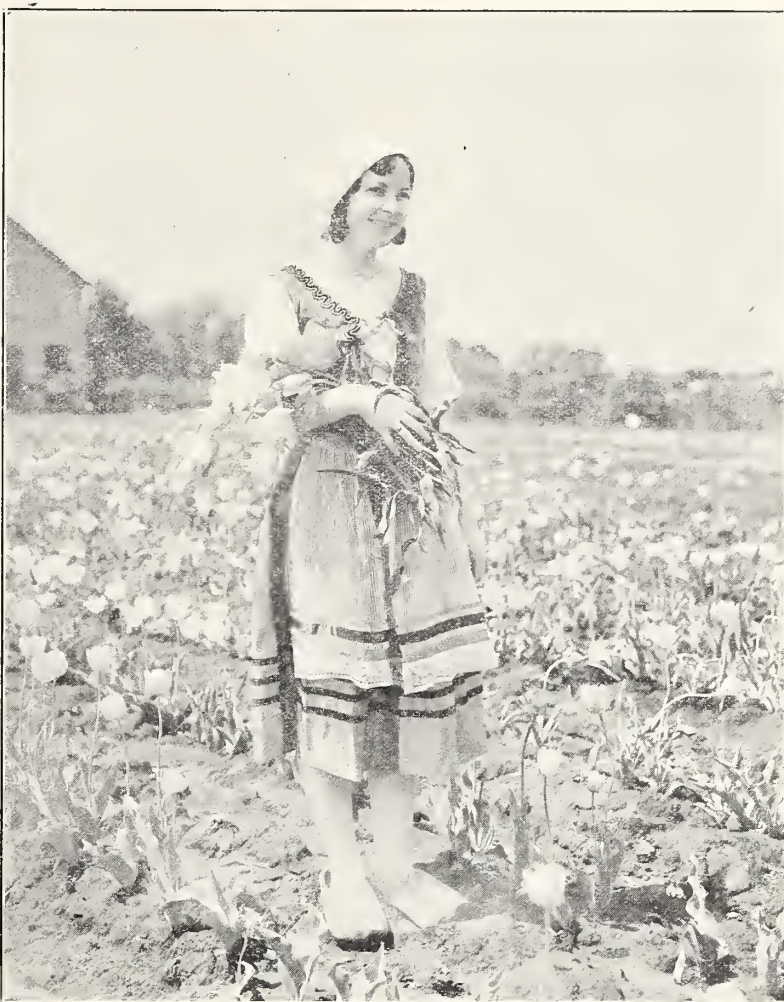
"Tiptoe Thru The Tulips"

Tulips are easy to grow. All their strength is stored up in the bulb so that drought or cold weather does not stop them from blooming. Plant in the fall and LEAVE THEM IN THE GROUND IN THE SAME PLACE FOR THREE YEARS! You do not have to dig them up each year unless you should wish to change their location. You can grow tulips in many places where other flowers would not bloom. They can be planted in front of shrubs, around small trees, in partial shade, around buildings or in beds in your flower garden. The only place tulips cannot grow is in wet, soggy ground where water stands. Plant them eight inches deep and six inches apart for best results. After tulips bloom and the tops die down, you can sow flower seed or plant dahlias right over them and get two crops of flowers from the same space without harming or moving the tulip bulbs in anyway. If your soil is a heavy, soggy clay, mix plenty of sand with